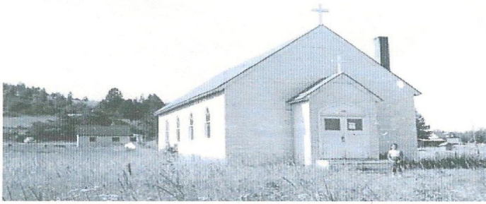
St. Michael Church, Worley, erected 1922